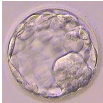
An embryo at Blastocyst stage

Infertility is one of the newest and fastest growing sciences in medicine, as such we often struggle to keep up with major advances in equipment and embryo culture, which are proven to directly benefit patients and lead to increased pregnancy rates, giving more families the chance to happen.